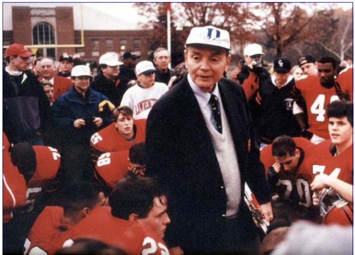
Legendary New Jersey Coach Passes Away at 82