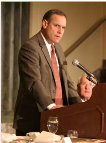
University of Cincinnati Head Coach Mark Dantonio