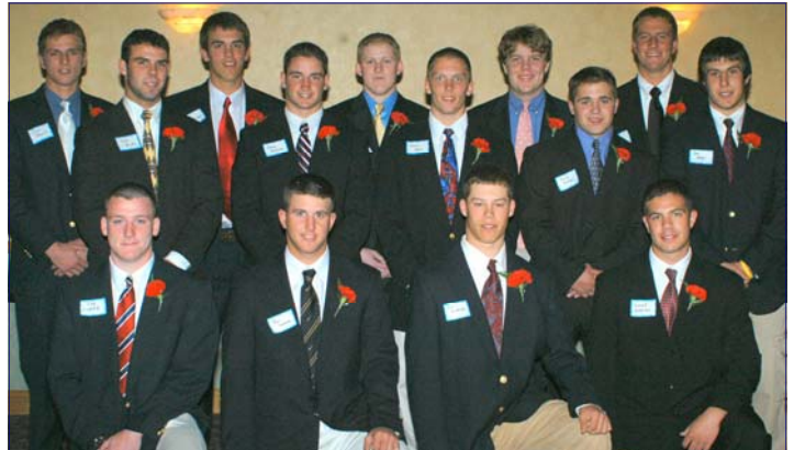
The 2006 Joe Yukica Chapter Scholar-Athletes at the chapter's 19th annual awards dinner on May 9.