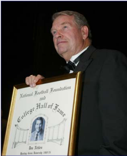
Coach Don Nehlen receives his Hall of Fame plaque at the 48th Annual Awards Dinner

Nehlen spent 21 years at WVU, guiding the Mountaineers to two undefeated regular seasons and 13 bowl game appearances. Named National Coach of the Year in 1988, he became the 17 th coach in NCAA Division I-A history to record 200 wins.